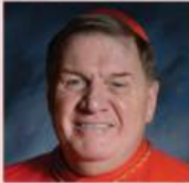
CELEBRANT Cardinal Joseph W. Tobin, CSSR

Cathedral of St. Mary of the Assumption 151 N. Warren Street, Trenton